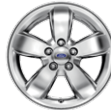
17" Chrome-Clad Aluminum Optional