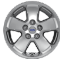
16" Cast-Aluminum Standard