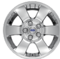
16" Bright-Machined Aluminum Standard on Hybrid Limited