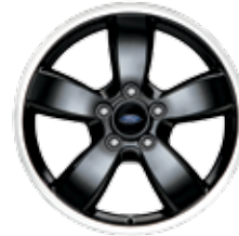
17" Premium Black with Machined-Finish Outer Ring Included on Sport Appearance Package