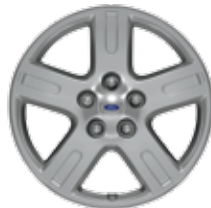
16" Unique Cast-Aluminum Standard on Hybrid